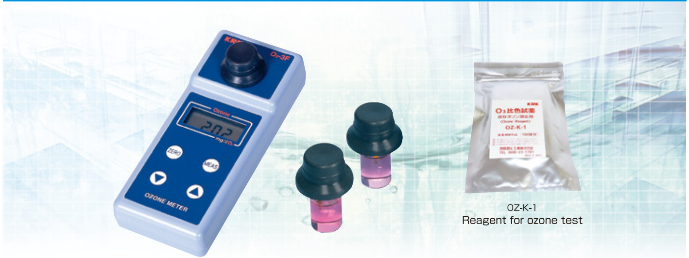
OZ-K-1 Reagent for ozone test